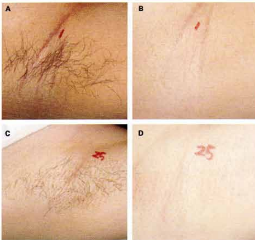
Figure 1. A and C show pretreatment status. B and D demonstrate post-treatment status 8 months after the last treatment. Volunteers refrained from shaving for 4 weeks prior to their last follow-up. No prominently growing axillary hairs were observed in D. However, thinned axillary hairs are seen in B.

In one volunteer (skin type III) treated with HR, perifollicular hyperpigmentation was observed at the third treatment session, and thus treatment was discontinued. In another volunteer treated with HR, mild hypopigmentation was observed at the second treatment session. This patient decided to continue treatment, and at the 9 month follow-up her skin had regained its normal color. However, no adverse effect was observed during or after HR-D treatment.